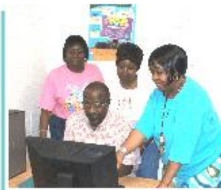
(Left) Adults in the LOG ON! lab learn how to become income tax preparers. The course was provided by the Internal Revenue Service in collaboration with The United Way.